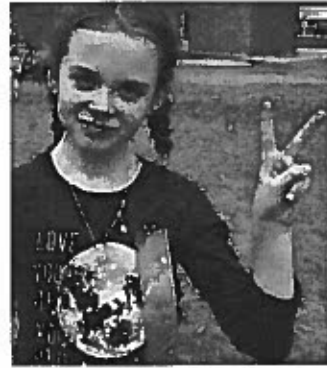
Primary Fun Run participant heads to the finish line. Peace and good luck to all the runners!